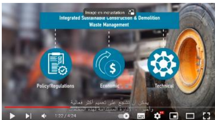
The WES video “Construction and demolition waste”