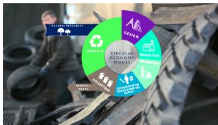
The WES video on “Circular Economy”