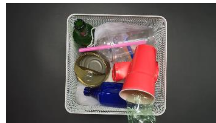
The WES video on “plastic pollution and single use plastics”